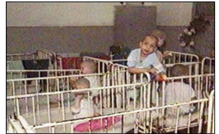
A crowded orphanage bedroom

If I would have had good grades at school, the teacher would let me go in town and I was supposed to come back at a certain hour." - H.G.