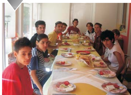
...GSB youngsters having a copious breakfast