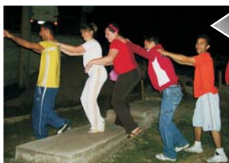
The orphans with the staff members are dancing...