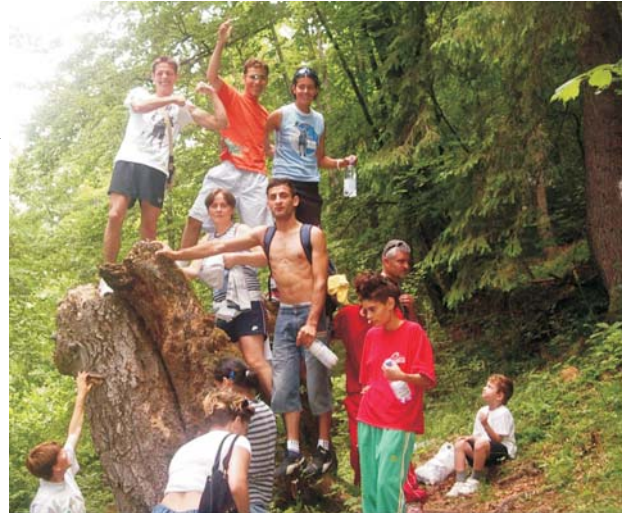
Hiking toward Scarisoara ice cave